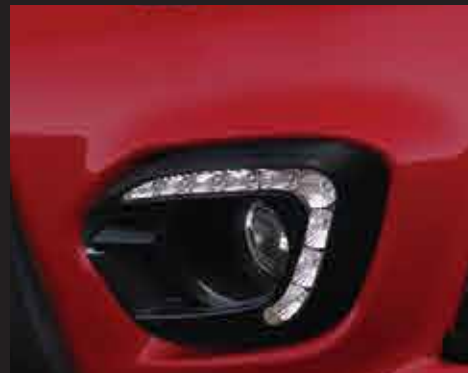
DAYTIME RUNNING LED LIGHTS