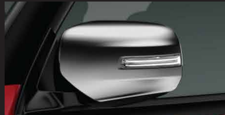
AUTO FOLDING ORVM