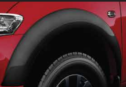
SIDE WHEEL ARCH FLARE