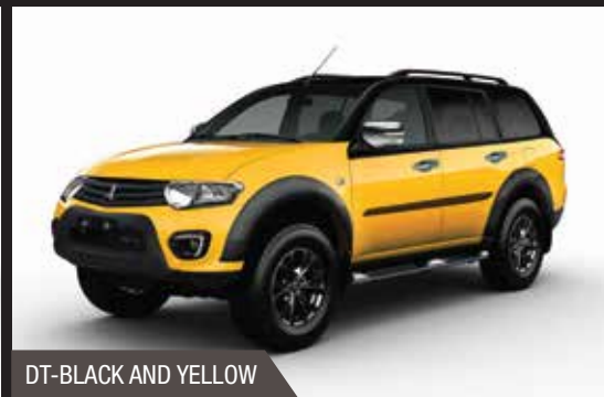
DT-BLACK AND YELLOW