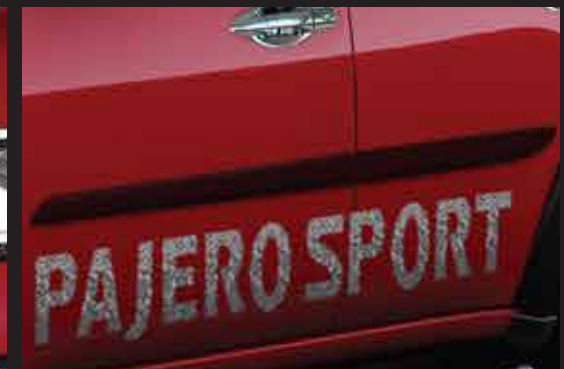
NEW COLOUR DOOR MOLD GARNISH