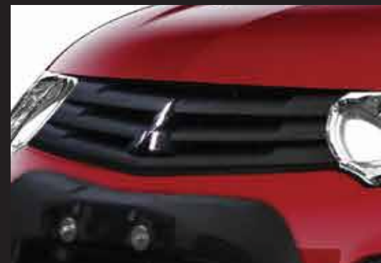
FRONT RADIATOR GRILLE