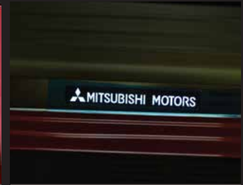
ILLUMINATED SCUFF PLATE