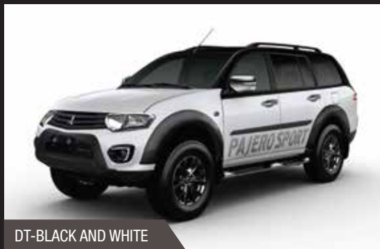
DT-BLACK AND WHITE