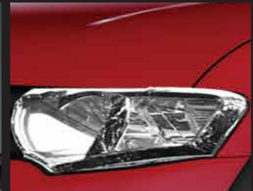
HID HEAD LAMPS