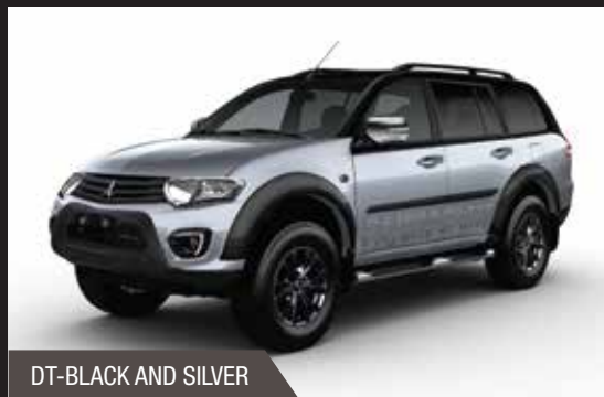
DT-BLACK AND SILVER