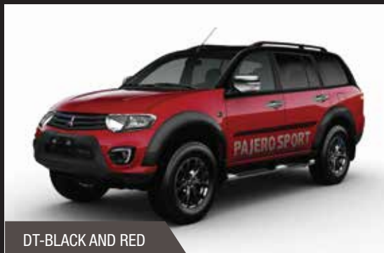
DT-BLACK AND RED